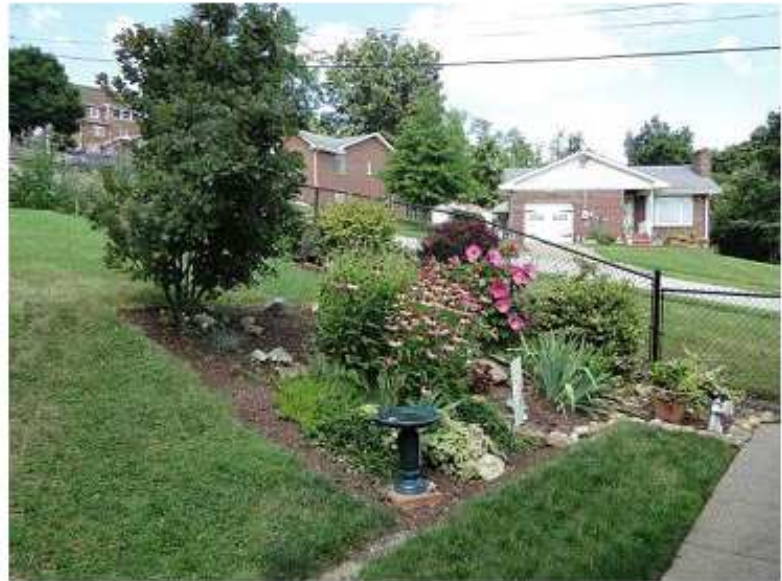
YARD Attractive landscaping